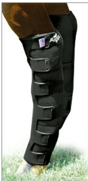
Six or Nine pocket ice boots available. ( nine pocket shown )