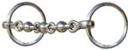
Loose Ring Waterford