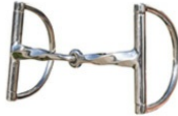
Slow Twist D Ring

To locate your nearest Professional's Choice Dealer, call 1.800.331.9421 or visit www.profchoice.com