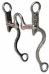
Show Shank Correction