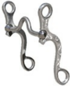
Del Mar Medium Port