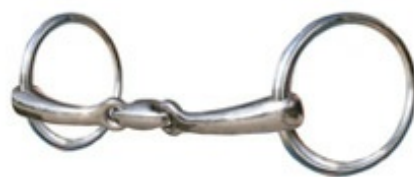
Double Break Snaffle